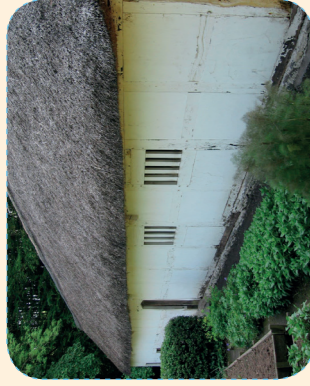
(h) Sain Ffagan: Amgueddfa Werin Cymru (c) St Fagans: National History Museum

Built in 1508, Hendre'r-Ywydd Uchaf is an example of the wealthier Welsh farmhouse of its time - a late-medieval cruck-framed hall-house. The house was moved to St Fagans in 1956 and nothing remains at the site. Cruck-framed hall houses comprise five bays. The lower two housed cattle and horses, the middle bay a work room, and the upper two an open hall with open hearth in the centre and a bedroom.